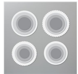
Layering Circles Dies - 151770