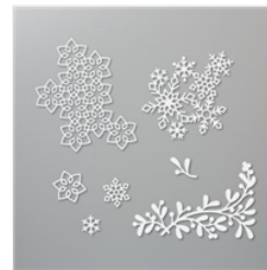
Christmas Layers Dies - 150654