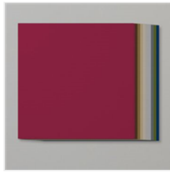
Neutrals 12" X 12" (30.5 X 30.5 Cm) Cardstock - 147003