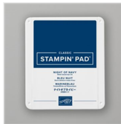
Night Of Navy Classic Stampin' Pad - 147110