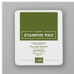
Mossy Meadow Classic Stampin' Pad - 147111