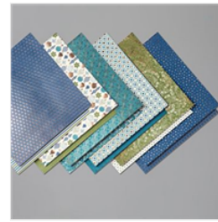
Brightly Gleaming Specialty Designer Series Paper - 150429