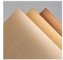
Brushed Metallic Cardstock - 153524