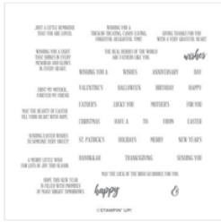
A Wish For Everything Cling Stamp Set (En) - 149320

Melissa Sepowitz melissa@thestampingninja.com thestampingninja.com