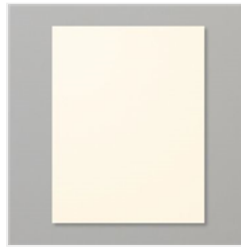
Very Vanilla 8-1/2" X 11" Cardstock - 101650