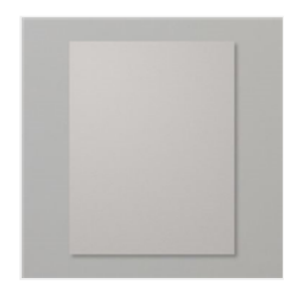
Gray Granite 8-1/2" X 11" Cardstock -146983