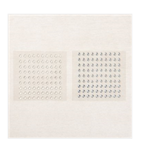
Silver & Clear Epoxy Essentials -155567