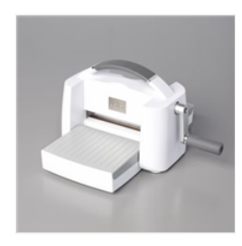
Stampin' Cut & Emboss Machine -149653