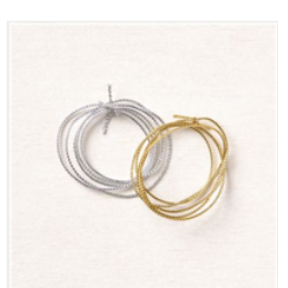
Simply Elegant Trim - 155766