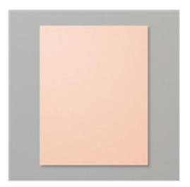
Petal Pink 8-1/2" X 11" Cardstock -146985