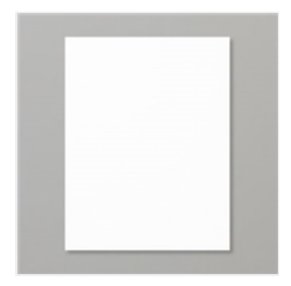
Basic White 8-1/2" X 11" Cardstock 159276