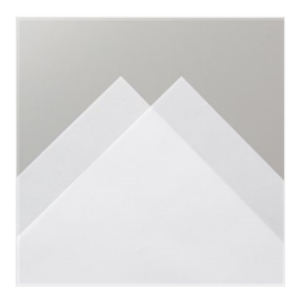
Vellum 8-1/2" X 11" Cardstock -101856