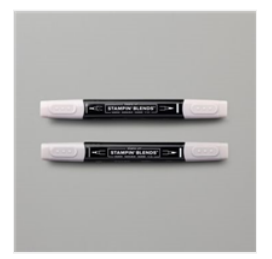
Gray Granite Stampin' Blends Combo Pack 154886