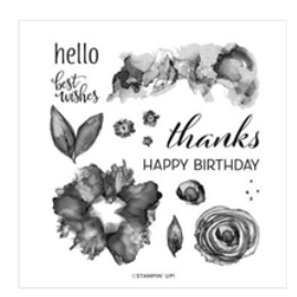
Artistically Inked Cling Stamp Set -154542

Melissa Seplowitz melissa@thestampingninja.com thestampingninja.com