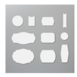
<u>Tasteful Labels</u> <u>Dies - 152886</u>