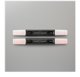
Petal Pink Stampin' Blends Combo Pack -154893