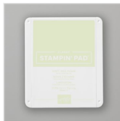
Soft Sea Foam Classic Stampin' Pad - 147102 Price: $8.00