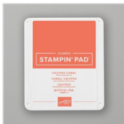
Calypso Coral Classic Stampin' Pad - 147101 Price: $8.00