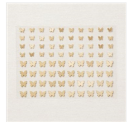
Brushed Brass Butterflies - 158136 Price: $10.00