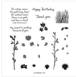
Wildflower Path Photopolymer Stamp Set (English) - 157735 Price: $22.00

Melissa Sepowitz melissa@thestampingninja.com thestampingninja.com