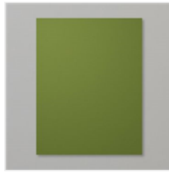
Mossy Meadow 8- 1/2" X 11" Cardstock - 133676 Price: $9.25