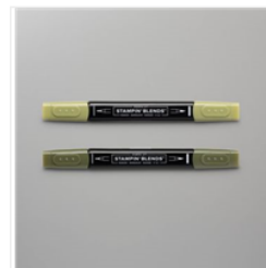
Mossy Meadow Stampin' Blends Combo Pack - 154890 Price: $9.00