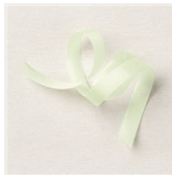
Soft Sea Foam 3/8" (1 Cm) Seam Binding Ribbon - 159680 Price: $8.00