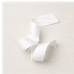
White 3/4" (1.9 Cm) Frayed Ribbon - 158138 Sale: $6.75 Price: $7.50