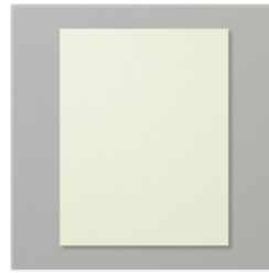
Soft Sea Foam 8- 1/2" X 11" Cardstock - 146988 Price: $9.25