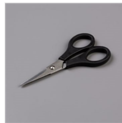
Paper Snips Scissors - 103579 Price: $11.00