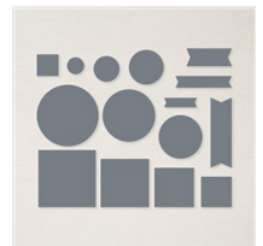
Stylish Shapes Dies - 159183 Price: $30.00