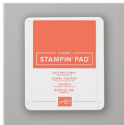
Calyпсо Coral Classic Stampin' Pad - 147101