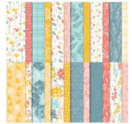
Inked Botanicals 6" X 6" (15.2 X 15.2 Cm) Designer Series Paper - 161157