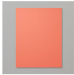
Calyпсо Coral 8-1/2" X 11" Cardstock - 122925