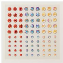
Iridescent Pastel Gems - 160429